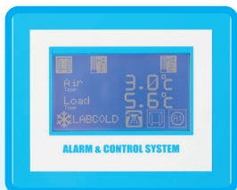
Hygienic touch screen controller

Fitted with a Dual Compressor to ensure greater temperature control and peace of mind in the event of failure of one of the systems. Each complete refrigeration system provides 100% performance, sufficient to cool down and maintain temperatures correctly without help from the second compressor.